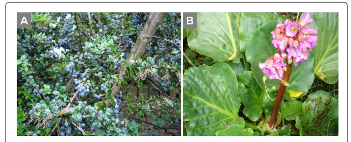
Figure 1: Photographs of Berberis darwinnii (A) and Bergenia cordifolia (B) taken from the author's garden.