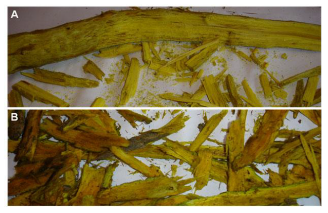
Figure 2: Stem wood (A) and steam bark (B) of B. darwinnii appearing yellow due to their principal constituent, Berberine .