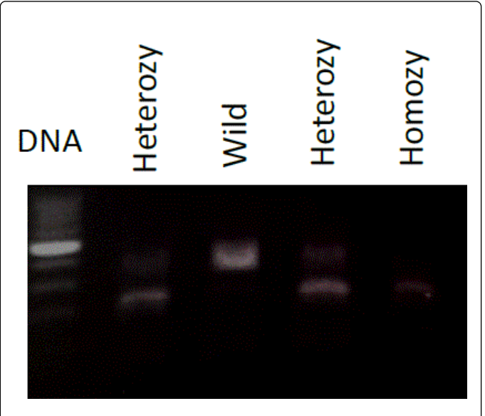
Figure 2: Represented gel-electrophoresis of UGT2B7*2 genotype among sample of healthy Arab Jordanian volunteers.

Ten µl of PCR product was then incubated with 5 units of Fok1 restriction enzyme (Bio labs, England) at 37°C for overnight. The wild-type allele (UGT2B7*1/*1) identified by 2 bands with 312, 69 bp size. Homozygous UGT2B7*2/*2 was identified by 3 bands (201, 111 and 69 bp size) while heterozygous UGT2B7*1/*2 genotype was identified by 4 bands (312, 201, 111 and 69 bp size). As shown on Figure 2, the digested PCR product was separation of on 3% agarose gel for detection of rs2108622 variation after gel staining with ethidium bromide.