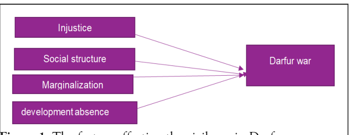
Figure 1: The factors affecting the civil war in Darfur.

The factors affecting the civil war in Darfur: The factors that are affecting the war in Darfur can be shown as following (Figure 1).