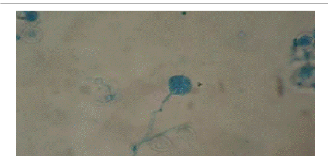
Figure 3: Branching hyphae and chlamydospore in a lactophenol cotton blue preparation made from mycelial colonies of HCF cultured on SDA (2.5% glycerol and 0.005% chloramphenicol).