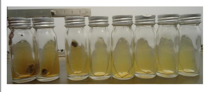
Figure 1: Result of the agar dilution assay for CMSE which indicates the minimum inhibitory concentration i.e. 0.0156%, the dose of CMSE greater than 0.0156% does not permit the growth of HCF.

The results of ethanol extracts of C. molle seed extracts, by "the agar dilusion assay" are presented in (Table 1). The results shows that ethanolic extract of C. molle seed at concentrations of 2% 1%, 0.5%, 0.25%, 0.125%, 0.0625%, 0.0313% and 0.0156% have the inhibitory effect on Histoplasma capsulatum var farciminosum . However, 0.0078% concentration of the extract has no significant antifungal effect on Histoplasma capsulatum var farciminosum and it could not be able to prevent the growth of fungi on culture. The highest concentration of CMSE without growth inhibitory effects was 0.0078%. The MIC of CMSE that inhibit the visible growth of HCF was 0.0156% (Figure 1).