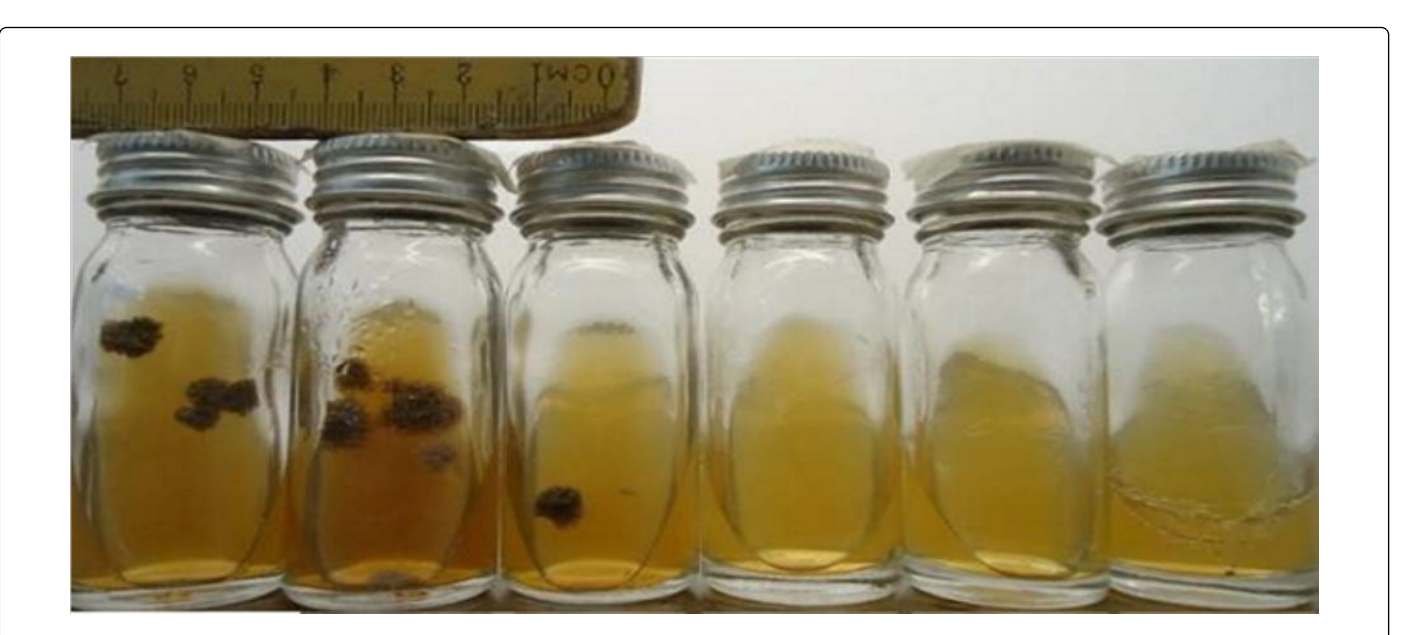
Figure 2: Result of the agar dilution assay of ketoconazole which indicates the minimum inhibitory concentration of the well-known antifungal drug ketoconazole that used for comparison for CMSE efficacy.

Table 1: Growth of HCF in different concentrations of C.molle seed extract and ketoconazole.