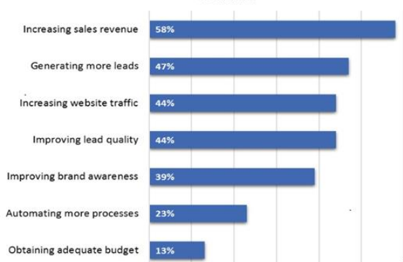
What are the MOST IMPORTANT GOALS for a digital marketing plan to achieve?

4. Quality of life is as much a concern to entrepreneurs as it is to other residents. After all, entrepreneurs also have families and are just as concerned about having good schools and other amenities. A community that offers high quality amenities might find that their entrepreneurial retention rate is better than places that don't emphasize quality of life.