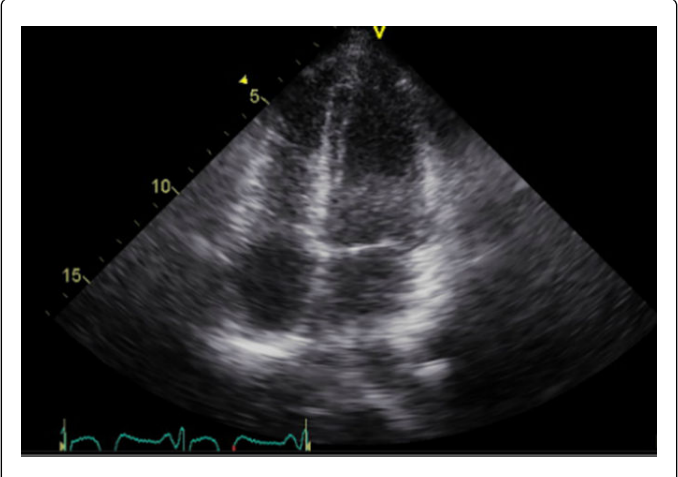
Figure 2: Normalization of contractility.

That evening, she had another acute episode of tachycardia and hypertension followed by hypotension and PEA arrest. The patient underwent CPR and she received two iv boluses of epinephrine 1 mg and was placed on epinephrine and dopamine infusions. An IABP was placed. There was clinical suspicion for a pheochromocytoma but an abdominal/pelvic CT was negative. Over the next 24 hours, the epinephrine and dopamine were weaned off, the patient was again extubated, and the IABP was removed. Repeat TTE four days following the initial arrest showed LVEF 55% and no regional wall motion abnormalities (Figure 2).