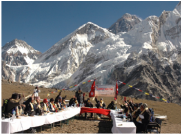
Photo 4: Cabinet meeting of Nepal government near Mount Everest base camp (5,542m) as a stern response to global warming in the Himalayas.