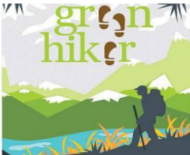
Photo 5: Green Hiker Campaign to opt for sustainability of mountain tourism.

mobility and other elements induced global warming on mountain tourism. In this context, the use of electric vehicles in tourism industry is considered as a concrete response.