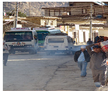
Photo 3: The popular Mt. Annapurna circuit trek route being motorized as an augmented source of carbon emission.

positive [29]. It mentions that the road construction is not really good for the conservation of wonderful nature and culture. The increased trucks, jeeps and bikes coincided with growing number of tourist traffic are creating noise and air pollution and thus irritating the tourists themselves. Trekking trails and motorable roads should be separate and away from each other as the great trekking route like round Annapurna circuit trek needs to preserve by stopping road construction. There is high need to stop the further process of road construction from Muktinath to Thorang pass, from Humde Manang to Tilicho Lake and from Tilcho to Bhimtang of Manang. It will, otherwise, not only increase carbon emission and global warming but also distract tourists.