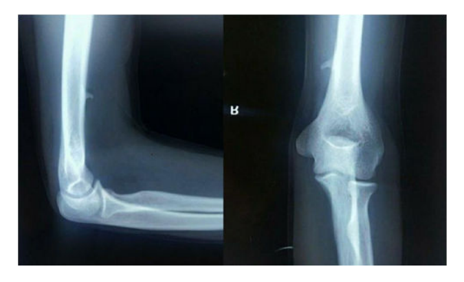
Figure 1: AP and Lateral radiograph of 16 years female presented with 5 months history of pain in the right distal arm showing a bony spur proximal to medial epicondyle in anteromedial aspect of distal 1/3^{\rm rd} humerus.

Radiologically, the bony spur was consistently pointing towards the elbow joint and located anteromedially as one could appreciate it in both views thus ruling out the chances of osteochondroma which points away from the joint. Spur was situated between 4 cm-8 cm from the medial epicondyle. Ultrasonography (USG) showed the ligament attachment to the spur along with proximity of median nerve and brachial artery without any cartilage cap.