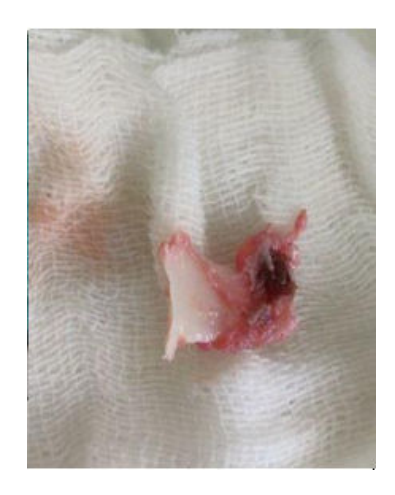
Figure 4: Post excision of spur showing the ligamentous attachment at its tip and measuring 10 mm in length.