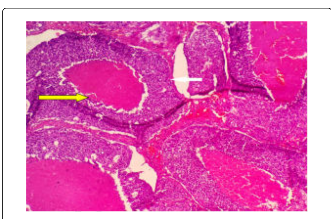
Figure 1: Contrast leak at the mid-cervical esophagus.

Computed Tomography (CT) scan was performed which revealed fractured right first rib with apical hematoma, and right side haemothorax with pneumomediastinum. Patient was transferred to Intensive Care Unit (ICU), sedation with 1 mg midazolam and 20 mcg fentanyl done, right side tube thoracostomy was inserted which drained 200 milliliters of blood. After stabilization of the condition, gastrograffin swallow was done which showed contrast leak at the midcervical esophagus (Figure 1).