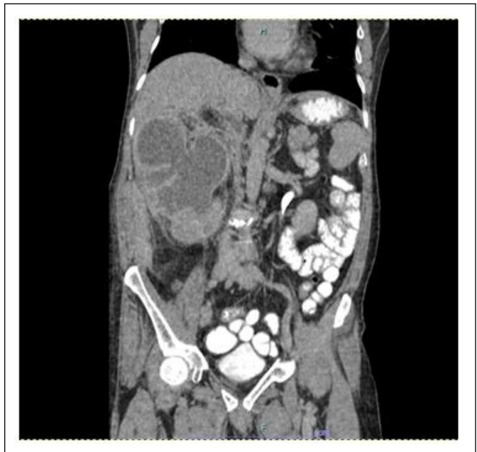
Figure 2: Coronal view of CECT abdomen showed large right pyonephrosis with thin cortex.

Histopathology examination showed squamous metaplasia of the lining of epithelium with full thickness dysplasia at renal pelvis. No lymph vascular invasion seen. The surrounding parenchymal tissues showed marked fibrosis with lymphocytic cell infiltration with some areas of foamy macrophages. The glomeruli were scleroses and tubular thyrodisation seen. This confirmed the diagnosis of SCC of right renal pelvis with background of chronic inflammation and non-functioning kidney. TNM staging at the time was T1N0M0 (Figure 3).