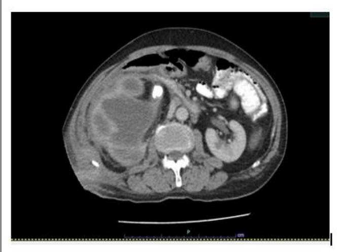
Figure 1: CECT Abdomen showed huge right pyonephrosis with right PUJ stone.