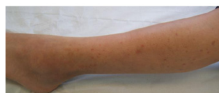
Figure 2: Erythematous-purpuric macules and papules on lower legs.

hyperkeratosis, with some focal vacuolar degeneration of the basal membrane and a mostly lymphocytic perivascular mononuclear infiltrate with scanty leucocytoclasia of neutrophils in the superficial dermis, vessels hyperplasia and endothelial swelling with some extravasated erythrocytes.