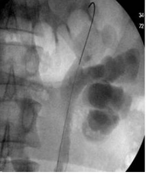
Figure 3: Intra-operative retrograde pyelogram showing the patient's upper urinary tract anatomy bilaterally.

The stone in the mid third of the upper moiety ureter was completely disintegrated using LASER, however the stone in the upper third of the lower moiety was pushed back and both ureters were stented. Three weeks later, the patient underwent cystoscopy with removal of all three stents along with repeat bilateral ureteroscopy. This revealed some residual fragments on the left side requiring LASER lithotripsy and replacement of the stent, due to the severe impaction and oedema some minor mucosal abrasions. While on the right side both limbs did not have any significant residual fragments. To this effect, the patient was discharged after satisfactory post-operative recovery with a view of right lower moiety ESWL as well as full 24 hours' urine in six weeks time for metabolic work up. The stone in the lower calyx of the left kidney will be kept under observation (Figure 4).