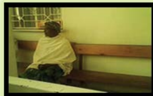
Figures 5: Pictures of Patients affected by rabies from dog bite.