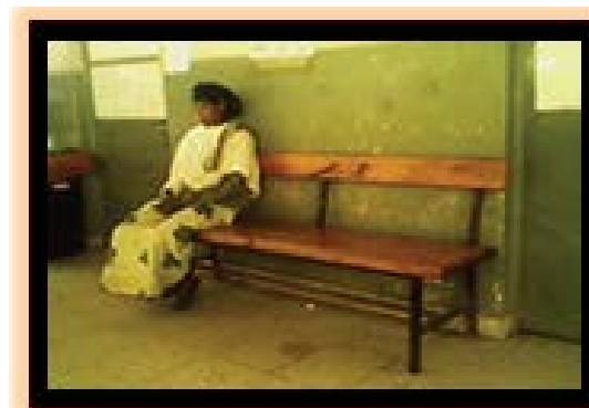
Figures 6: Pictures of Patients affected by rabies from dog bite.

From the investigation based at AMBO Community it has been observed that the dog management and vaccination influence the spread and occurrence of rabies. About 75% of local community are not aware of allopathic [28]. Based on our questionnaire and interview the respondents were identified according to their sex, religion, Educational status and Economic stability. Irrespective of the educational status most of the native people were going to local healers. From our observations it showed that, the individual with less and medium income are depending on the traditional medicine from Plants for diagnosing Rabies. While the