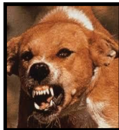
Figure 4: Dog affected by Rabies.