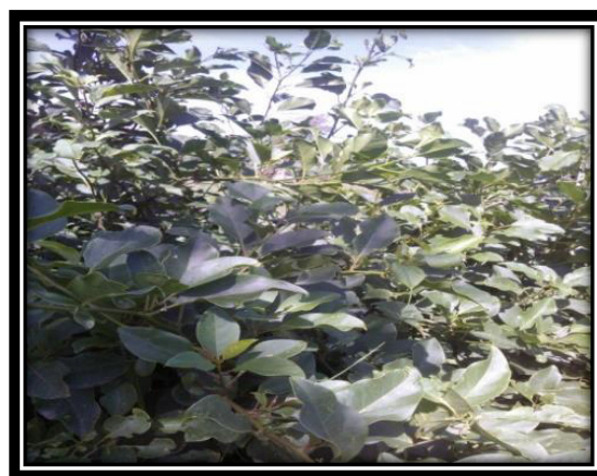
Figure 2. Croton macrostachyus (Euphorbiaceae).

days of cure (Table 3 and Figure 2) with an average of 22 days for T.M and E.M/A.M as 33 days.