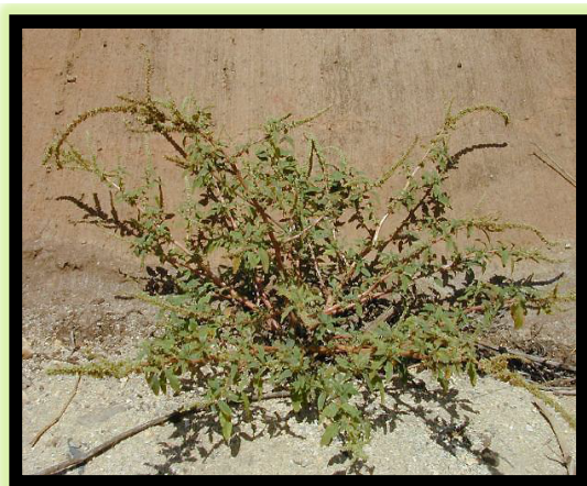
Figure 3: Amaranthes spinosus (Amaranthoideae).