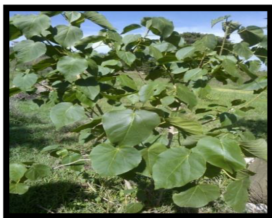
Figure 1: Phytolacca dodecandra (Phytolaccaceae).