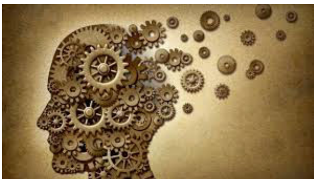
Figure 1: The importance to buy an hearing aid since the childhood.

It is said that the first therapist convinced of this power, well known for his capacity of persuasion, was the sophist Antifonte, (500 BC). He rented a shop near the market of Corinth to offer his services to afflicted people. He stated that there could not exist a pain so great that it cannot be relieved from its special 'conferences'. Perhaps it is possible to compare the work of modern psychotherapists to that of the ancient sophists, although, unlike them, some of modern professionals still use expressions as 'patients', 'disease' and 'care', even if the aim is the same: take care of those who are in a dysfunctional emotional state (Figure 1).