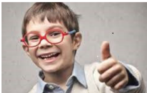
Figure 4: A mother use the sign language.

For a certain period of time, from birth to vocalizations, language development in deaf children and hearing impaired improves in the same way. Later, in the child with disabilities, the vocalizations end, but the period of babbling doesn't start because there is a feedback system: the child speaks, but he hears a different sound, so he is not able to self-correct. The use of gestures is greater, since it replaces the use of the first words.