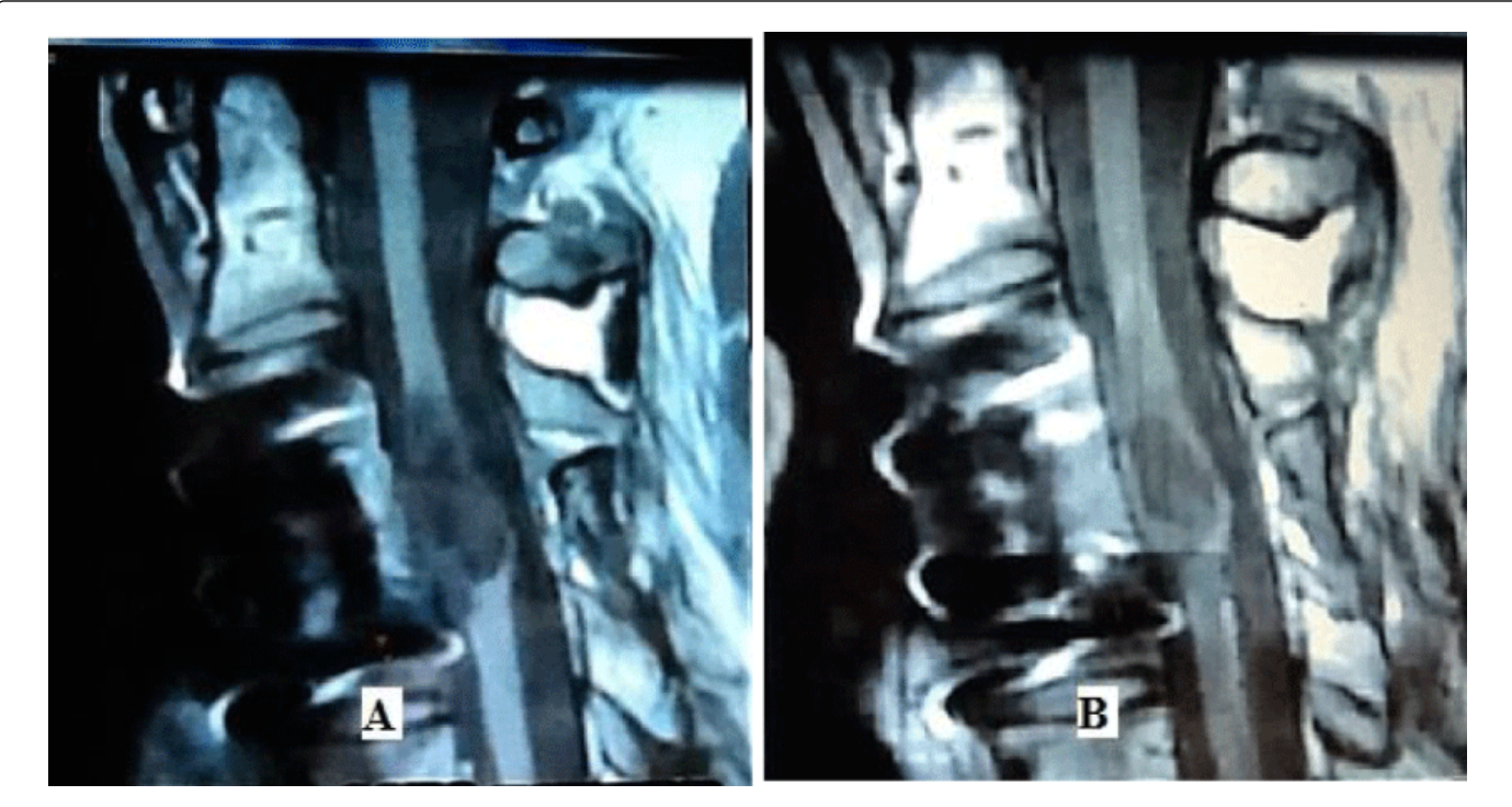
Figure 1: Tractographic images of spinal cord of a patient with spinal cord injury undergoing human stem cell therapy. A: Before treatment; B: One year after treatment.

During the treatment, no adverse effects or complications were observed.