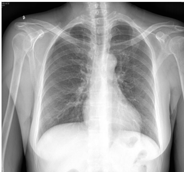
Figure 1: Chest X-ray film showed a normal size heart with clear lung markings.

A 53-year-old woman complained of intermittent angina pectoris for 2 years and was admitted to our hospital to further evaluate cardiac mass. Physical examination was unremarkable. Results of routine laboratory tests including thyroid function (FT3 5.32 pmol/L, FT4 21.07 pmol/L, TSH 4.1 uIU/ml) were all normal. Chest plain film showed a normal size heart (Figure 1).