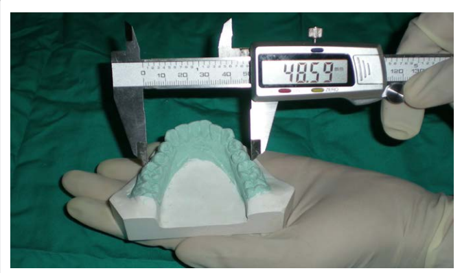
Figure 2: Measurement on mandibular intermolar width on study model.