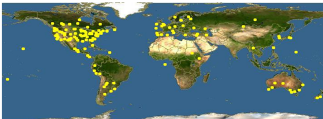
Figure 1: Distribution of Asparagus officinalis (Yellow dots shows plant distribution).

and medical industry to face up the issues hindering in execution of professional services, to help the society [13].