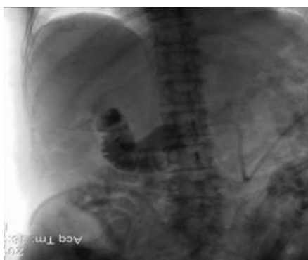
Figure 3: Shows a big size tube could pass through easily to the former narrow area.