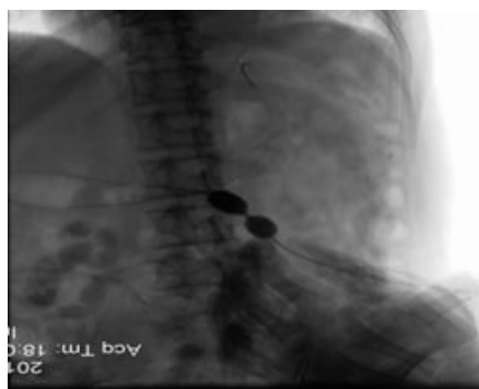
Figure 2: Demonstrates ballooning of narrow part of fistula to (enlarge the diameter) after injection of contrast material.