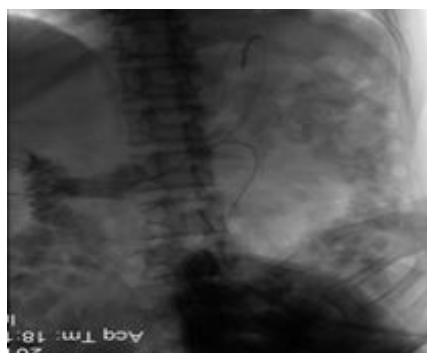
Figure 1: Shows the insertion of guide wire and angiographic catheter as it passes through previous surgical fistula, we could see the wire pass to the duodenum then back to the fundus of stomach.