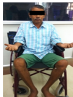
Figure 1: Showing patient on 1 st follow up.

regains consciousness but his cognition was fair, the speech was slurred, unable to swallow solid food. Functionally rolling on the bed and sitting balance was absent, all the 4 limbs were spastic with MAS2, dependent for all ADL activities, claw deformity of both the hand. The bladder was under an indwelling catheter which was removed after 3 weeks on the return of voluntary control. However sensory impairment was not marked. He was under the home exercise program for 4 months because of social and financial issues.