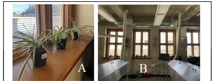
Figure 1: Plants (A. Chlorophytum comosum ) were placed at eye-level (1 every 8.7 meters) around the perimeter of the cadaver laboratory. Two cadavers (B.) are located centrally in the room on down-drafted steel tables.

Spider plants ( Chlorophytum comosum ) were placed around the laboratory on windowsills (Figure 1A) that are easily visible to students while taking their exams. [17] recommends at least two good sized plants for every 100 square feet (approximately 9.3 square meters) of indoor space for best visibility. Inside the laboratory there are a total of 16 plants to account for the measured square footage appropriately (approximately 8.7 square meters). The plants were switched for even sunlight exposure purposes and watered as needed.