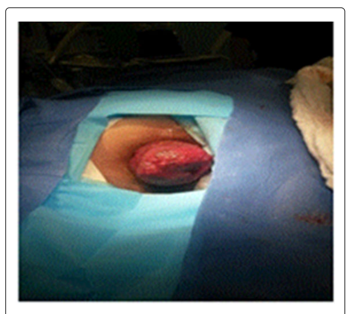
Figure 2: After the anaesthesia is applied, the rectal wall in relation to the polyp protruded though the anus.

An Altemeier's rectosigmoidectomy is executed without complications and the patient is released after 48 hours, with satisfactory evolution. The histopathologic study reports a tubulovillous adenoma with high grade dysplasia, exulcerated, with free resection margins (Figures 3 and 4).