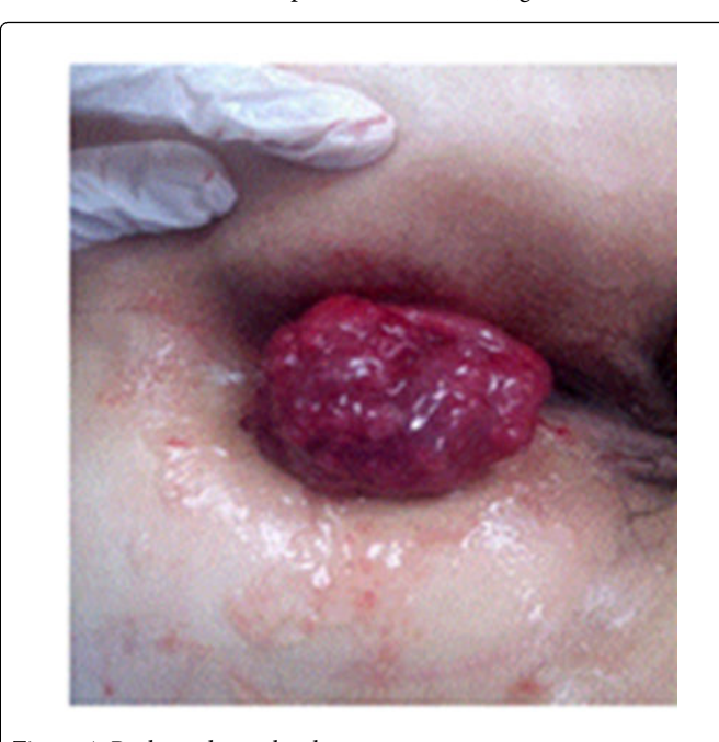
Figure 1: Prolapsed rectal polyp.

The proctological examination in the sims position showed evident prolapse towards the posterior quadrant of the anal margin with a polypoid lesion of approximately 5 cm \times 5 cm, irregular surface, with necrotic areas and fetid seropurulent secretion (Figure 1).