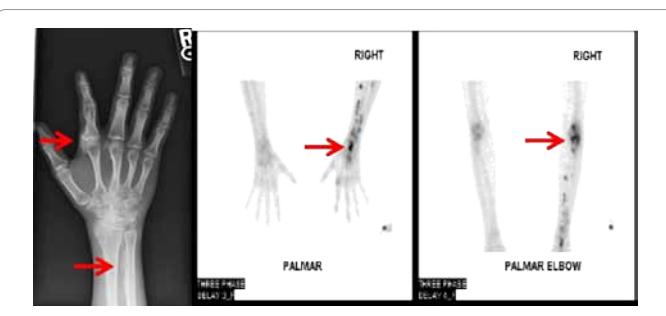
Figure 2: Case 2 - Progressive Osseous Heteroplasia. A: X-ray showing soft tissue B: Technetium 99 m Scan showing metabolically active soft tissue ossification (arrows)

metabolically active soft tissue ossifications localized to right forearm, elbow and hand, posterior lateral border of the left scapula and the mid aspect of the left tibia (Figure 2). Guanine nucleotide binding protein alpha stimulating activity polypeptide ( GNAS ) gene sequencing identified a previously described mutation in the exon 7 of the GNAS gene, predicted to result in a frameshift and loss of function.