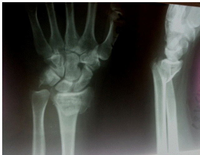
Figure 1: Pre-op.

All these patients were admitted to the hospital and operated on as early as possible, depending on local condition of tissue, oedema, hematoma and fitness of the patient for anaesthesia. After informed written consent, ORIF was performed via a volar approach and using 2.4 mm titanium variable angle volar locking plates (Figures 1 and 2). Surgery was performed under regional or general anesthesia and fluoroscopic guidance.