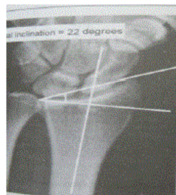
Figure 3: Radial Inclination.

Normal RH is 11 mm and was measured as the distance between 2 lines perpendicular to the long axis of the radius, one drawn at the tip of the radial styloid and another drawn at the distal ulnar articular surface (Figure 4).