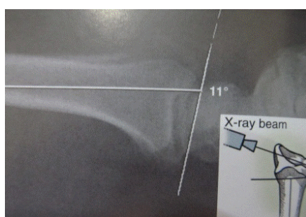
Figure 5: Volar Tilt.

Total 42 patients underwent this surgery those included 34 males and 08 females. The mean age and Standard Deviation (SD) at the time of the injury was 40.64 \pm 12.36 years (range from 19 to 70 years). Twenty two (52.4%) fractures involved right side while 20 (47.6%) fractures occurred on the left.