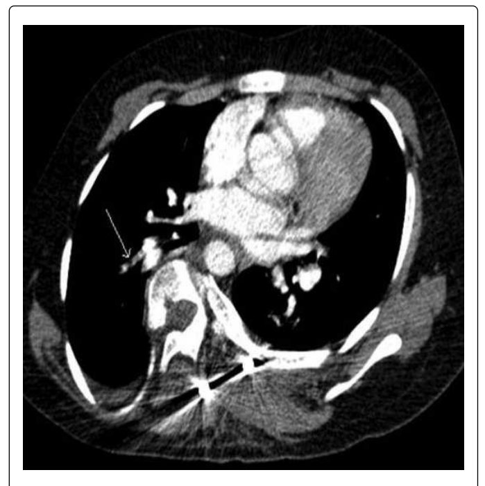
Figure 2: Distal pulmonary embolism in a branch of the right inferior lobar artery on chest angioscan.

g/L). During surgery, massive bleeding occurred. The patient received six red blood cell units, three fresh frozen plasma units, one platelet unit and three polyvalent immunoglobulins (Clairyg®, Lfb-Biomedicaments, France). Immediate post-surgical evolution was positive. Preventive LMWH treatment with Lovenox* 40 mg subcutaneous (sc)/day (Sanofi- Aventis, France) (48 Kg) was started on day 2 followed by verticalisation with a brace on day 4. On postoperative day 10, due to the presence of a thrombocytopenia of 17 g/L (500 g/L on day 3), LMWH administration was stopped. On day 14, the patient was sub febrile (38.5°C) without any clinical or biological sign of infection and complained of a brief episode of retrosternal chest pain. Blood oxygen saturation value was 98%. The electrocardiogram showed sinus tachycardia of 125 beats per minute. Chest X Ray was normal. His blood chemistry panel revealed hemoglobin value of 8.9 g/dL, a negative thrombophilic status, a platelet count of 14 g/L and an increase in D-Dimers>10000 µg/L (ELISA, N<500 µg/L). Lower limbs Doppler ultrasonography did not reveal any thrombus but a distal pulmonary embolism was detected in a branch of the right inferior lobar artery on chest angioscan (Figure 2).