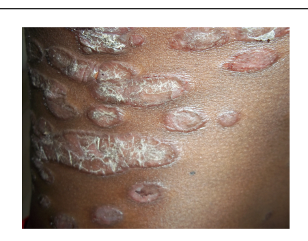
Figure 2: Plaque psoriasis.

A skin biopsy was made with histological confirmation of psoriasis in 47 cases or 10.5%. Eighteen patients had a positive HIV serology. These 18 patients are divided into six cases of vulgaris psoriasis