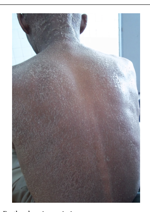
Figure 3: Erythrodermic psoriasis.

The treatment was indicated in 379 patients or 84.79% of the cases. The only topical medications were the most used in the treatment of psoriasis (62% of prescriptions). The protocols used were a combination of corticosteroids, acetyl salicylic acid and natural vitamin A (47.8%); calcipotriol (23.7%), the anaxeryl (7.8%). For systemic treatments: metrotrexate (5.2%) and acitretin (4.9%) (Figure 3).