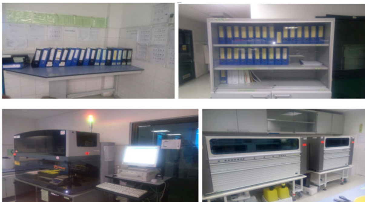
Figure 1: Various documents and records for implementation of ISO 15189: 2012 and available platforms

Advanced laboratory molecular technique was used for testing of HIV viral load and early infant diagnosis in Ethiopian Public Health Institute, National HIV Molecular reference laboratory and all professionals in the laboratory are well trained in and out of country training for this diagnostic modality. Available data from various records of implementation of ISO15189:2012 standard (Figure 1) was taken and narrated thematically.