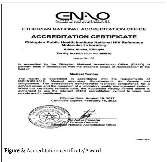
Figure 2: Accreditation certificate/Award.