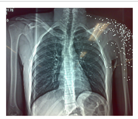
Figure 1: X- Ray Chest showing pellets.