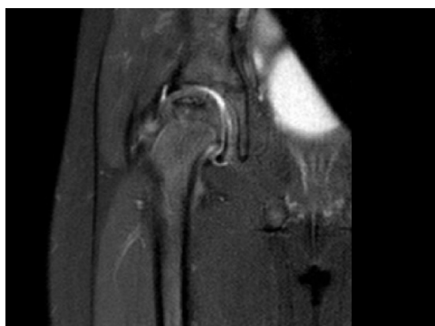
Figure 1: MRI right hip-right sided joint effusion with collapse of the femoral head indicating avascular necrosis.