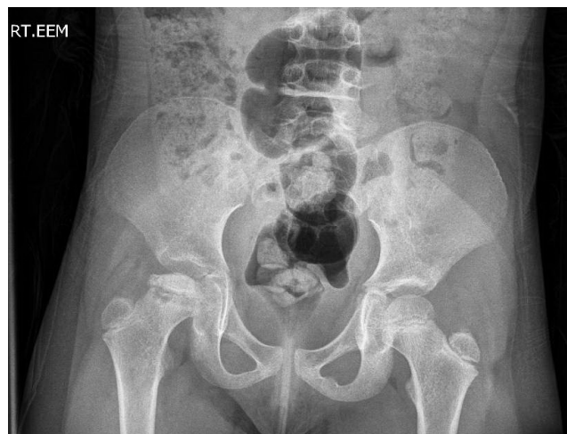
Figure 4: Late X-ray with evidence of perthes on the right, right joint effusion which is likely reactive in nature secondary to avascular necrosis.