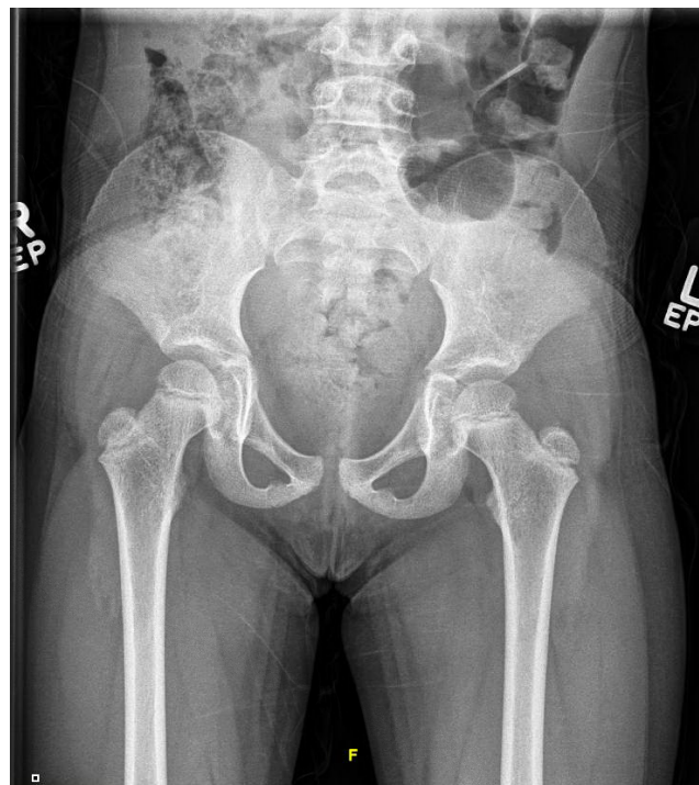
Figure 3: Early X-ray—femoral head and neck are normal in appearance. Bilateral acetabula are well formed, no evidence of avascular necrosis.