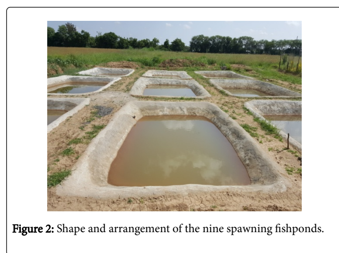
Figure 2: Shape and arrangement of the nine spawning fishponds.

have dimensions of 7 m length × 5 m width × 1.4 m depth and the wall slope of 1:1 (Figure 2).