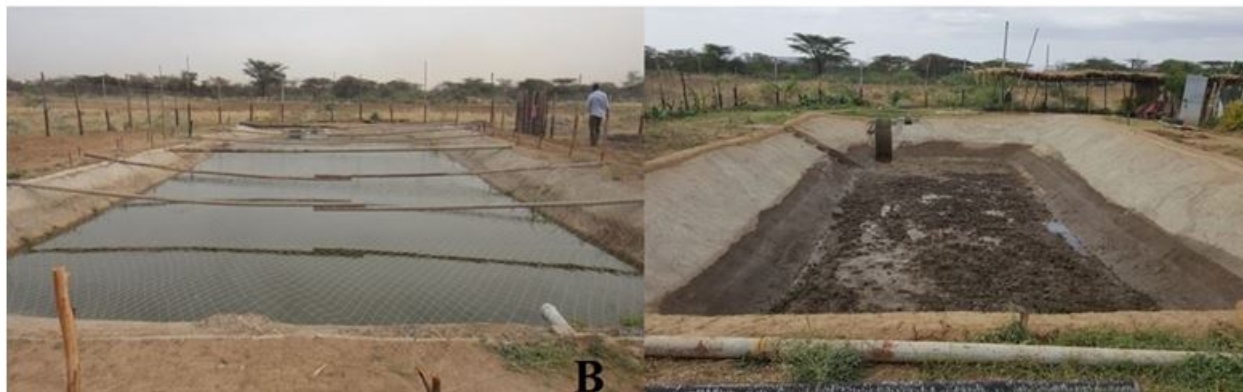
Figure 1: A) Wall and bottom schematic diagram of "Three-in-one" nursery fishpond structure. B) Nursery pond, with water (left) and drained (right).

Building the nursery fishpond was started in February 2014 by manual excavation and completed nearly after four months. The fish pond included structures such as inlet, outlet and pond ladder. A sedimentation pond of 10 m \times 1.2 m \times 1 m was designed on the inlet line to prevent muddy water from entering the pond during the rainy season. For the production safety of the fish pond, spillway diverting flood and protective fence around the fishpond area and bird net over the pond were subsequently added.