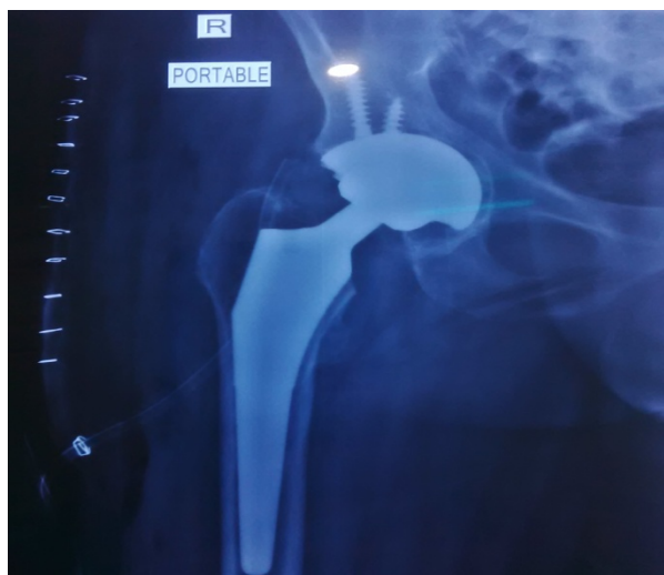
Figure 3: Post-operative X-ray of pelvis.