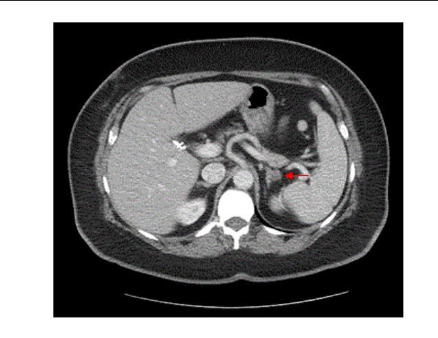
Figure 1: CT demonstrating left adrenal mass (arrow).

CT scan of the abdomen and pelvis demonstrated normal pelvic structures but revealed a 1 cm left adrenal adenoma (Figure 1) confirmed on adrenal MRI.