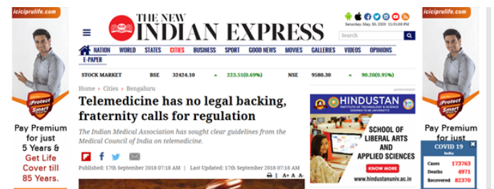
Figure 2: Telemedicine

can open a new source of additional income for medical tourism facilitators, companies, and healthcare providers. Good thing is that Almost all big corporate hospitals and clinics have already started acquiring or developing their own telemedicine tools to connect to the world. (Figure 2).