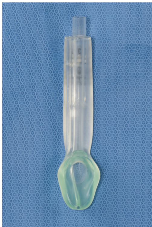
Figure 2: i-gel supraglottic airway device.

checked and calibrated before use on each patient and the measured leak volume was noted. When the patient arrived in the anaesthetic room, blood pressure, heart rate and ECG monitoring were instituted.