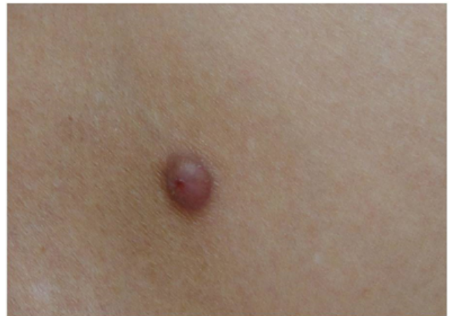
Figure 1: Clinical findings.

A 62-year-old-male with a 19-year history of type 2 diabetes mellitus and a 26-year history of chronic renal failure developed a pale-red-swelling on his right chest (Figure 1) a few years ago. His medical condition of diabetes mellitus and chronic renal failure are stable under using some medicines and dialysis. Based on clinical findings, our first diagnosis was epidermal cyst with inflammation, eccrine poroma, keratoacanthoma or fibroma, however, histopathological results after removing the all swelling under local anesthesia indicated poroid hidradenoma (Figure 2). There were no atypical or malignant findings. Now, this patient doesn't have any recurrence.