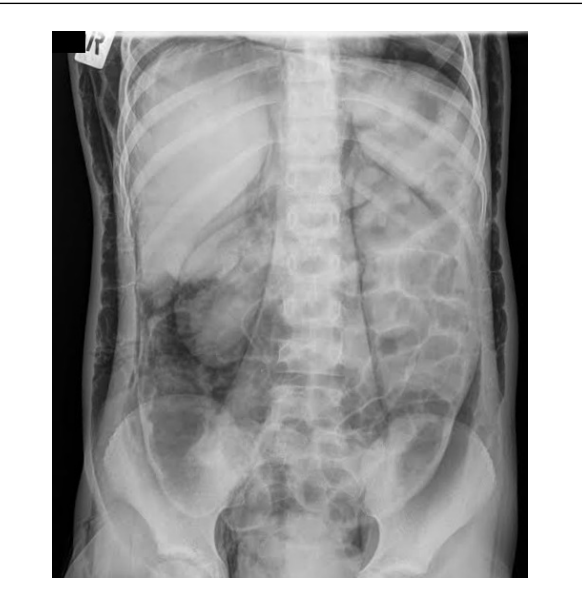
Figure 2: Urgent abdominal imaging studies revealed an extended pneumoperitoneum with retroperitoneal free air. Abdominal subcutan emphysema was visible.

chest and abdominal subcutan emphysema was visible. A chest tube was immediately inserted and then she was intubated and ventilated. Laparotomy revealed a 1 cm wide perforation of the transverse colon (Figure 3) with multiple air bubbles in the mesocolon and omentum (Figure 4). The perforation was closed and a terminal ileostomy was performed. Abdominal tube was inserted. Biopsy supported the diagnosis of severe ulcerative colitis. The patient remained intubated and mechanically ventilated for 1 day postoperatively. She was treated with combined antibiotic therapy (ceftriaxone and metronidazol) for 5 days and received a red blood cell transfusion while being admitted to PICU. The chest and abdominal tubes were removed on the third postoperative day and the patient was successfully transferred back to general ward on the 8th postoperative day. Two months after the intervention she is now scheduled for total colectomy and ileorectal anastomosis with pouch formation.