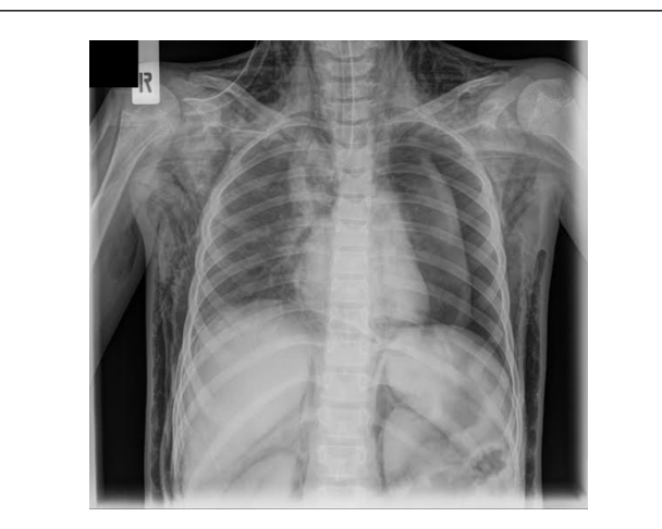
Figure 1: Urgent chest imaging studies revealed left-sided PTX and pneumomediastinum. Neck and chest subcutan emphysema was visible.

adalimumab medication. Therefore she underwent a diagnostic gastroand colonoscopy prior to a planned total colectomy. Colonoscopy revealed severe inflammation, pseudopolyps and granulated layer throughout the entire colon and ulceration of the distal part of the colon was prominent. After colonoscopy the patient developed acute respiratory failure. Subcutan emphysema was palpable in her face, neck and chest. The patient was moved to Pediatric Intensive Care Unit (PICU). On admission her vital parameters were unstable, she suffered from extreme chest discomfort and decreased air entry was audible on the left side of her chest.