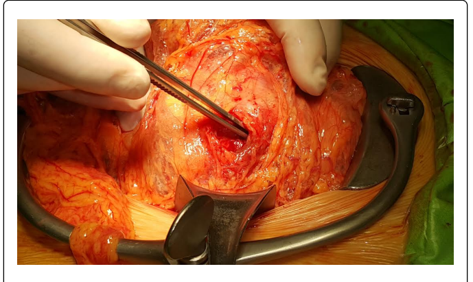
Figure 3: 1 cm wide perforation of the transverse colon was found.