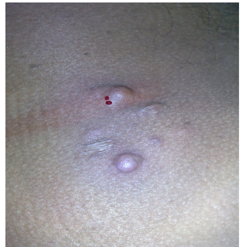
Figure 1: Skin-colored nodules on the back of the patient, (NB) blood drops due to injection of anesthesia.

Thorough clinical examination did not reveal any evidence of tumors located elsewhere or any pertinent past clinical history. No history of significant or hereditary diseases in the family was reported. A punch biopsy was performed by the clinician. Spindle cells with an eosinophilic cytoplasm were observed under high-power examination (Figure 2).