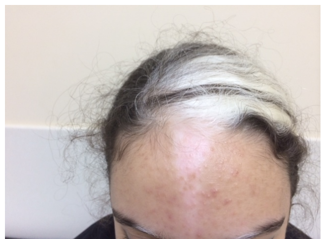
Figure 1A: A prominent, large depigmented patch on the central forehead associated with a white forelock and depigmentation of the hairs of the medial eyebrows and the eyelashes.

On examination, there was a depigmented patch on the midline forehead with adjacent white forelock and poliosis of the medial eyebrows. White patches were observed on the anterior of the midportion of her legs (Figures 1A and 1B).