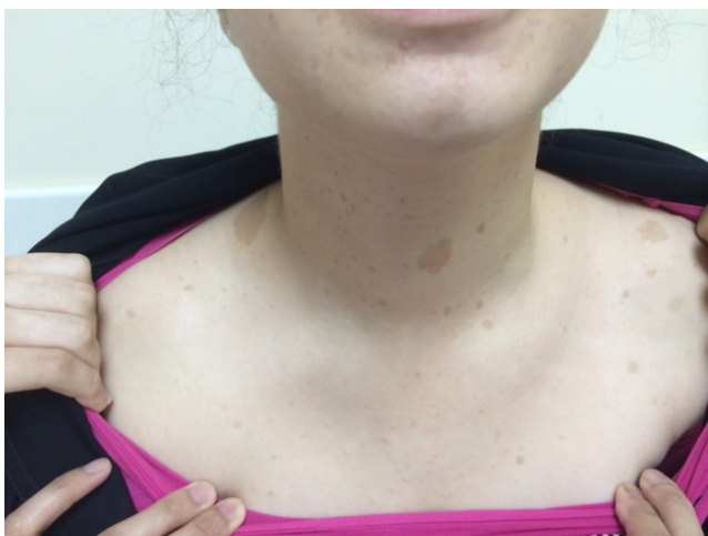
Figure 2A: Café au lait macules are seen on the chest and neck.