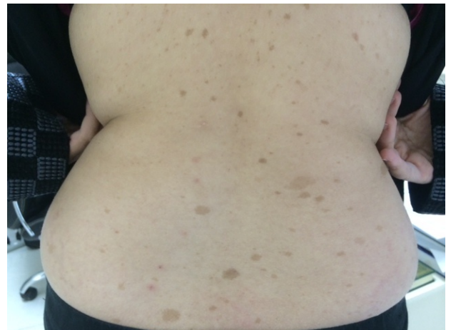
Figure 2C: Several café au lait macules are seen on the back.