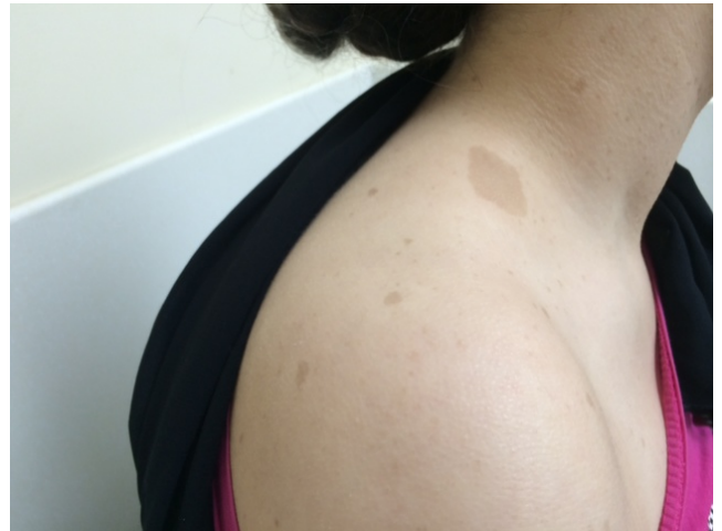
Figure 2B: Large café au lait macules on neck.