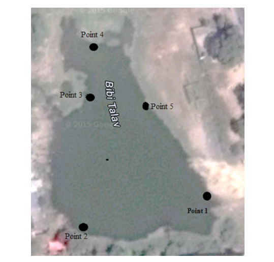
Figure 1: Satellite image of Bibi lake, Ahmedabad showing sampling sites denoted by dot.

The water samples were collected from five different points of the lake (Figure 1). The points can be classified into three types,