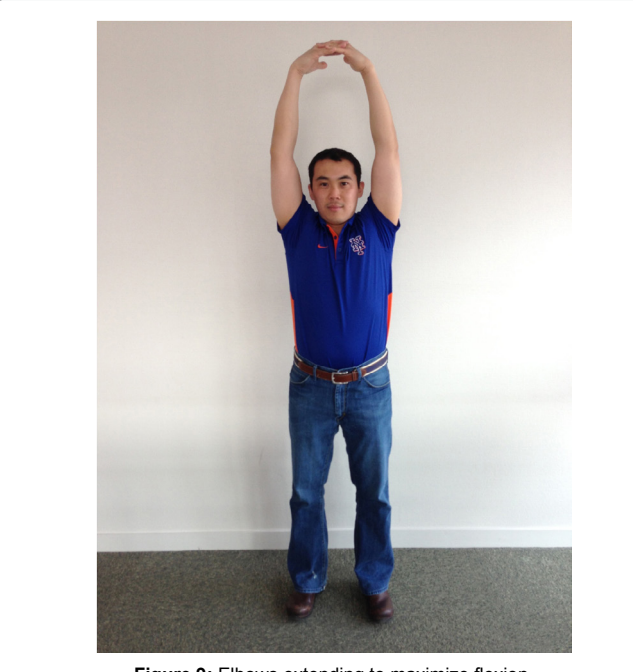
Figure 9: Elbows extending to maximize flexion.