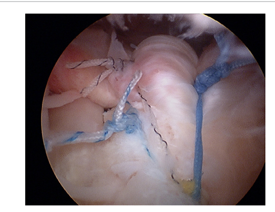
Figure 2: Intraoperative arthroscopic picture from the lateral portal showing the double row repair of the large rotator cuff tear. The cuff is reduced onto the great tuberosity.

Figure 1: Intraoperative arthroscopic picture from the anterior portal demonstrating a massive and retracted tear along in the medial to lateral direction. This tear would be classified as a Patte type 3 or a large grade rotator cuff tear.