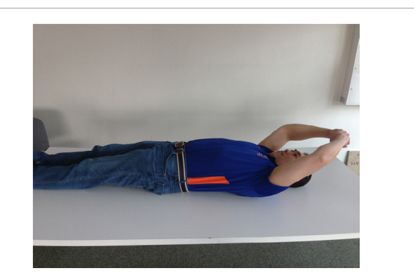
Figure 7: Supine active assisted forward flexion exercise done with the help of the contra-lateral normal arm. Range of motion as tolerated and limited by pain.

The strengthening phase should begin approximately 10 to 12 weeks postoperatively depending on the size of the tear, surgical fixation, and patient factors. Histologically, the remodeling phase is nearly complete, with tendon-to bone healing generally strong enough to allow for a graduated program of muscle strengthening. Importantly, both glenohumeral and scapulothoracic kinematics, as well as soft-tissue compliance, should be optimized so that a strengthening program