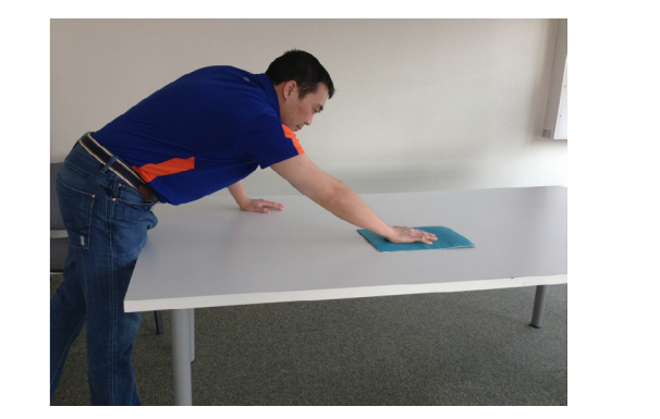
Figure 4: Table slide is performed with the patient leaning over a table and sliding the operative extremity on a piece of paper or a book on a table. Range of motion as tolerated, however it should be limited based on pain.

• Abduction pillow shoulder immobilizer for 6 weeks (4 weeks for partial or small to medium sized <3cm rotator cuff tendon tears with stable surgical fixation)