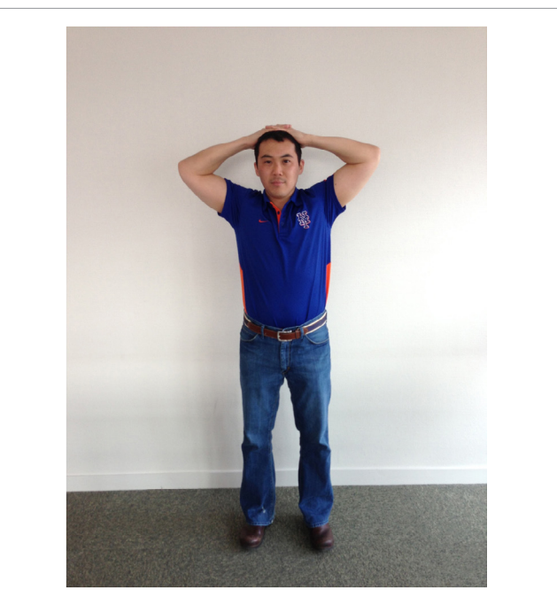
Figure 8: Hand on the top of head with active assistance from the normal contra-lateral arm.

Figure 7: Supine active assisted forward flexion exercise done with the help of the contra-lateral normal arm. Range of motion as tolerated and limited by pain.