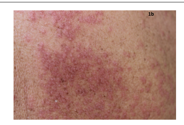
Figure 1b: At higher magnification shiny and violaceous papules and plaques.

All the following laboratory evaluations were in the normal range: biochemical parameters, complete blood cell count, white blood cell