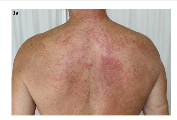
Figure 1a: Erythematous-purple papules and plaques coalescing and grouped in the upper back area.

Caucasian 69-year-old man complained of a very itchy rash on trunk that lasted three days. The patient was treated with oral gabapentin 300 mg/day for trigeminal neuralgia two weeks before this skin reaction. The patient had not been previously treated with gabapentin and was subject to no other medical treatment at the time. The patient had also been exposed to the sun causing first-degree burns on the back days before rash. Family history was non-contributory. Cutaneous examination revealed multiple flat papules, erythematous-purple, bright, coalescing and grouped in the upper back area (Figure 1a and 1b). Several papules have a fine scaling surface and Wickham striae are not appreciated. Dermographism was negative. Mucous membranes, scalp, nails or the rest of the skin surface were no affected.