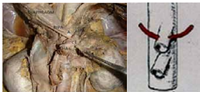
Figure 2: Photograph showing abnormal - pentafurcation of the coeliac trunk.

are of considerable importance in liver transplants, laparoscopic surgery, radiological abdominal interventions and penetrating injuries to the abdomen.