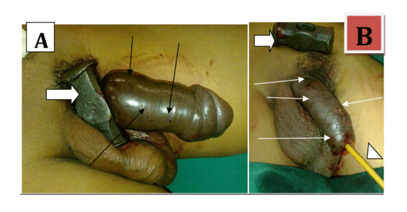
Figure 1: A. Metallic head of hammer at the base of penis (white thick arrow). The penile shaft is swollen. Multiple marks of needle prick [trial for decompression] seen on the shaft (thin black arrows), B. The metallic hammer head has been removed & kept aside (white thick arrow). The penile shaft is now decompressed. Multiple marks of needle prick seen on the shaft (thin white arrows). Foley's catheter is seen in situ (white arrowhead).

He was in severe pain, [pain score 9/10 on Visual Analog Scale] and not very co-operative. Trials for removal with lubricant anaesthetic jelly failed and needle decompression of corpora cavernosa resulted in bleeding.