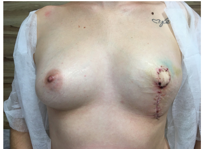
Figure 5: Patient after one month of surgery; Reconstruction using Grisotti.

The mass was removed and the surgical margins were clear achieved. It was CDI grade II Nottingham, ranging 1.8 cm. No angiolymphatic invasion was identified. The nipple showed Paget's