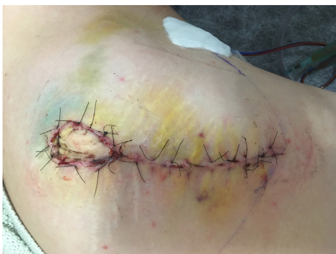
Figure 4: Patient after removal of areola and nipple and reconstruction by Grisotti's technique-7 days after the surgery.

The mass was removed and the surgical margins were clear achieved. It was CDI grade II Nottingham, ranging 1.8 cm. No angiolymphatic invasion was identified. The nipple showed Paget's