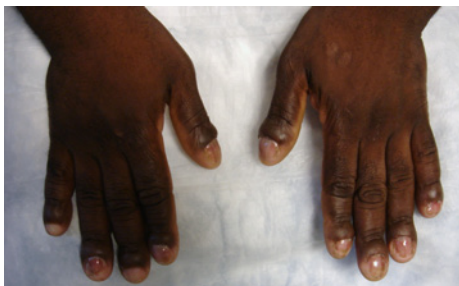
Figure 4: Clubbing of all the digits.

demonstrated a mildly enlarged pituitary in the sella turcica measuring 1.2 cm consistent with a pituitary macroadenoma. The patient was initially suspected of having acromegaly and an endocrine work-up was done. Laboratory results are shown in Table 1. X-rays of the patient's hands and feet consistent with hypertrophic osteoarthropathy are shown in Figures 5 and 6. A chest x-ray was performed which showed no masses, focal consolidation, pneumothorax or pleural effusion.