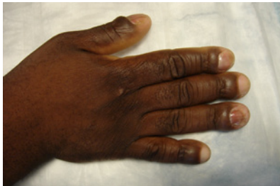
Figure 3: Clubbing of the digits.