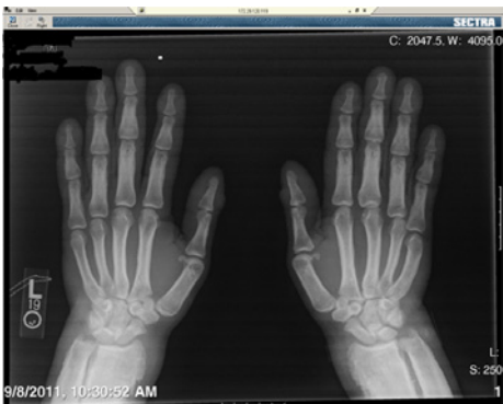
Figure 5: X-Ray of the wrists and hands. Extensive irregular periosteal reaction of the radius and ulna with diffuse soft tissue swelling consistent with hypertrophic osteoarthropathy.