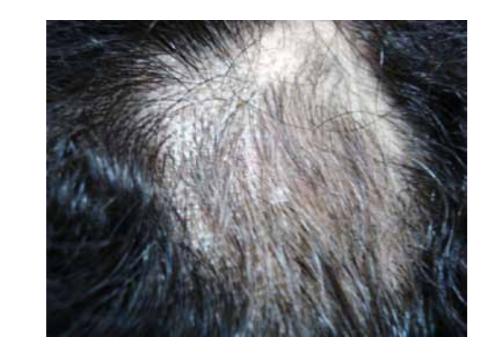
Figure 1B: Male patient with patchy alopecia areata after 3 months of treatment with oral zinc sulphate.