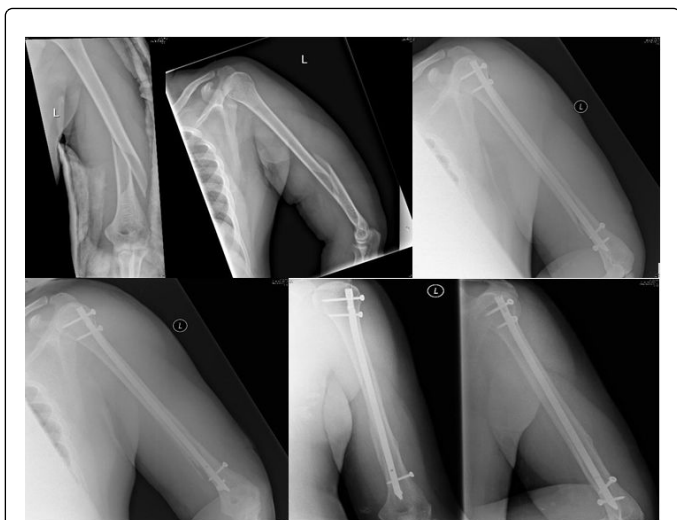
Figure 2: 3 years old male patient involved in RTA , presented with fracture left humerus A1 which was fixed by IMN, intact neurovascular pre and postoperative.