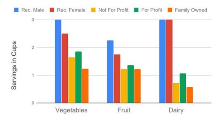
Figure 1: Nutritional Value National vs Facility.

There was only 474.08 mg of added sugar (SD of 137.88) in a day which is demonstrated in Figure 2 and was significantly different than recommendations with a p<0.001. Saturated fats made up 10.86% (SD of 0.01) of the daily calories. There were statistically significant differences between the average daily serving of saturated fats and the recommended (p<0.001) when compared to both the male and female recommendations. The percentage of saturated fats served was about 19.5% higher for females and 19.1% higher for males.