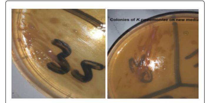
Figure 3: pink colonies of Klebsiella pneumonia when produce siderophore on new natural medium.

The isolates grown in new media to study the different between the siderophore productions in original media with new media, 70% (35/50) only of isolates that produce siderophores grown on new media.