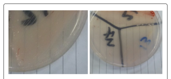
Figure 2: Colonies of K. pneumoniae produce siderophores on M9 medium.

Siderophores implicated as bacterial virulence factors. The role of iron acquisition systems is especially important in light of new findings that siderophores may represent a key front in the interplay between host and pathogen [16]. Subhi and Shaker [17] study the ability of Staphylococcus aureus , and Klebsiella pneumoniae isolated from rhinitis cases to produce siderophores as a virulence factor by using Rogers's method for extraction of siderophores and then the chemical and biological assay performed to detect siderophore (Figure 3).