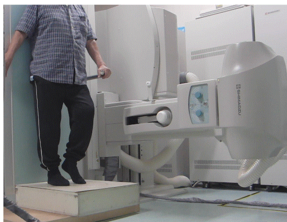
Figure 1: Stationary stepping activity. Each subject was asked to perform the stepping activity with holding onto the ipsilateral handrail to avoid trunk lean.

Stationary stepping activity was chosen for kinematic analyses due to higher accuracy and reproducibility than gait. Each subject was asked to perform the stepping activity during fluoroscopic surveillance using a 17-inch digital image intensifier system (15 Hz, SONIALVISION Safire 17, Shimazu Corp., Japan). The subjects were instructed to hold onto the ipsilateral handrail to avoid trunk lean. To avoid the influence of shoes or insole, all images were obtained while the subject was barefoot. To analyze knee kinematics during stepping activity, we selected frames between the unloading (UL) phase and the end of lateral movement of the knee during the weight-loading (WL) phase (Figure 1).